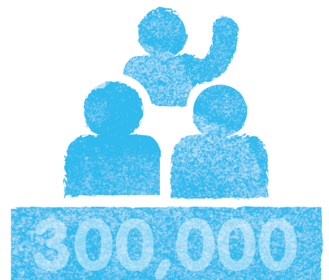
SCHOOL CHILDREN REACHED BY OUR EDUCATION TEAM IN TOTAL