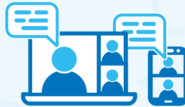
Laptop or smartphone