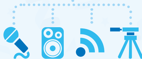
microphone, speakers, internet access and a tripod or a steady hand!